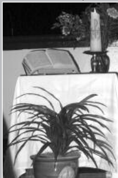
St. Paul School held its annual Opening Day Mass in prayer and faith as students began the new school year.

Have a very blessed and joyful Thanksgiving.